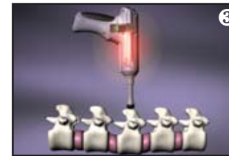
3 and the frequency (or speed) of motion are determined accurately in real-time.