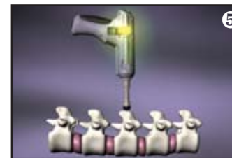
5 Auto-sense technology then sets the frequency of subsequent thrusts tailored to you.