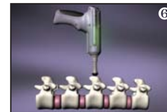
6 The instrument stops automatically when the adjustment is accomplished.