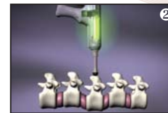
2 As the adjustment thrust is delivered, the precise amount of spinal motion