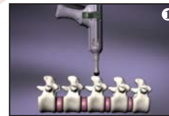
1 Embedded within Impulse iQ® is a motion sensor and micro-computer.

Impulse iQ® is controlled by micro-computer circuitry housed within the device that produces a controlled force that chiropractors can use to treat different areas of the body. Computer-assisted chiropractic adjusting with Impulse iQ® gives the doctor objective feedback about how your problem area is responding in real-time for custom tailored treatment just for you.