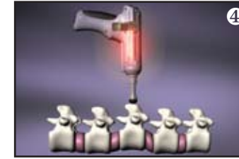
4 As the spine rebounds from each thrust, information is fed into the micro-computer.